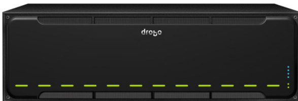
Drobo B1200i front (left) and back (bottom)

Ready to buy? Ask your preferred reseller, or visit www.drobo.com/where-to-buy/index.php