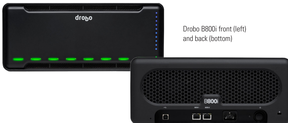
Drobo B800i front (left) and back (bottom)

Locate an Acronis reseller @ www.acronis.com/partners/resellers/locator.html .